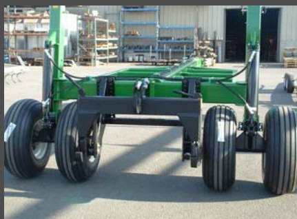
Requires Cat. 3 Narrow Quick Hitch

Designed to assist in ONE PASS TILLAGE - PACKING - PLANTING