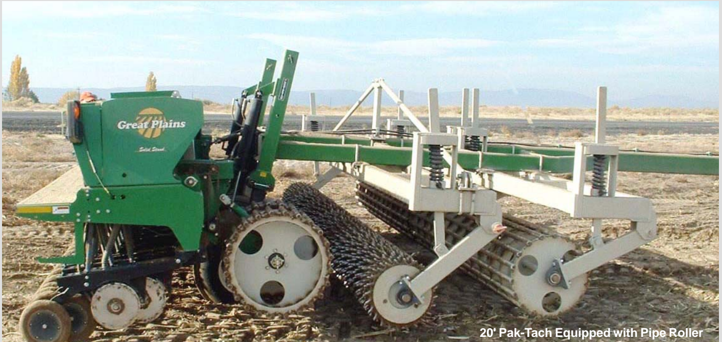
20' Pak-Tach Equipped with Pipe Roller

Designed to assist in ONE PASS TILLAGE - PACKING - PLANTING