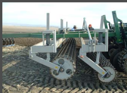
24" Diameter Bar Roller Packer